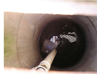
Drywells in landscaped areas tend to allow for long term standing water from the irrigation systems constantly adding water and sediment.

With summer rapidly approaching, now is the time to get your annual drywell inspections and servicing done. With the summer comes the monsoons. You don't want to find out in the middle of a storm that your drywells are not working properly because of debris or sediment. If your parking lot is full of water, your customers can't park and they can't come in and spend their money. Improperly working drywells can also be breeding locations for mosquitoes, and with mosquitoes there is an increased risk of getting the West Nile Virus or the Avian Flu. Infections of the West Nile Virus have increased year over year since Arizona has been tracking it. Finally, drywells that don't drain can lead to flooding, in extreme cases, leading to property damage and loss of income.