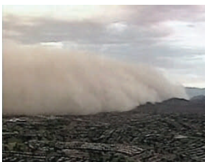
Improper dust control is a major factor in the particulates problem in our air quality.

Once again, the EPA has fined an Arizona construction company for failing to prevent dust during earth moving operations at a construction site. The fines were in excess of $100,000. The company is required to hold regular training programs for the employees and have a certified dust control coordinator for all projects 5 acres or more. The problem with dust and particulates is a serious one in Maricopa County as well as across the southwest. The EPA is working closely with Maricopa county officials to send the message that violations of the dust rules will not be tolerated as the EPA has classified the county as a serious non-attainment area for particulate matter.