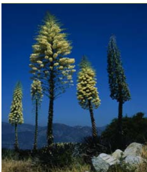
Converting to native southwestern plants will save water.

Quality in an Environmental Site Assessment is often mentioned yet often not accomplished in many inexpensive Environmental Site Assessments. In Nevada, there is at least a minimum certification by the state you must possess to perform Environmental Site Assessments. In Nevada, this program is known as the Bureau of Corrective Actions Certification Program. You must be or operate under direct supervision of a Certified Environmental Manager to perform any environmental consulting in Nevada. Look for this certification when requesting ESA’s in Nevada. Arizona is different! They have no certification or licensing requirements for any Environmental Consultants. In this case it would be prudent to look for consultants that have taken the time and made the investment to obtain certifications from other states such as Nevada and California . This, at a minimum, ensures that they meet some minimum requirements deemed necessary by these adjoining states. Look for Errors and Omission insurance. There should be no less than $1 million dollars in coverage. If you are working on multi-million dollar deals then consider $2 million or more as a minimum. Finally, get a professional opinion. When you have selected and have started using a consultant, have the work reviewed by an environmental attorney. This is an inexpensive way to make sure you get what you are paying for!